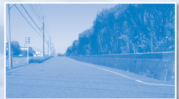
The road on the side of Taiyo-no-Oka Park

In this manner, please be assured that even your everyday roads have been designed to protect the residents of Urayasu City from natural disasters.